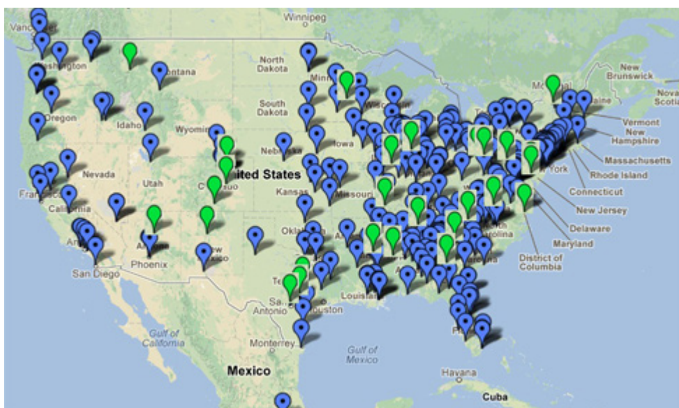
To date, the Foundation has funded 47 scholars in 36 CACREP –accredited counseling programs (in green). Its goal is to fund scholars in all 279 programs.