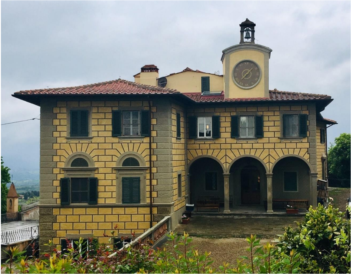
Casa Cares near Reggello, Italy See http://www.casacares.it