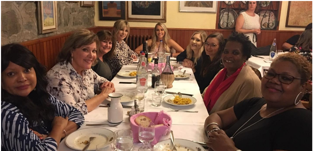
Participants at Ristorante Archimede