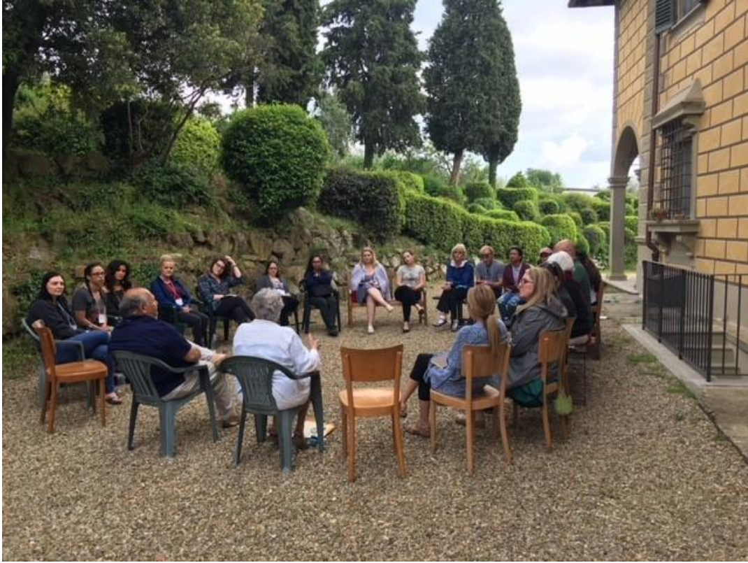
A Seminar Outside at Casa Cares