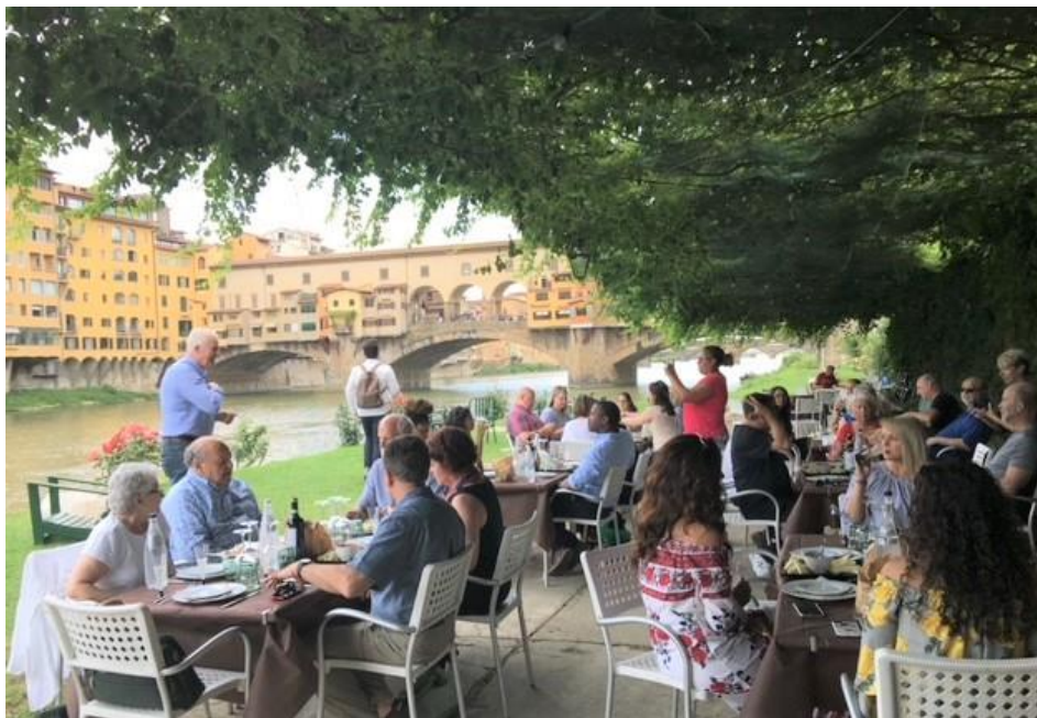
Lunch at the Rowing Club in front of Ponte Vecchio in Florence