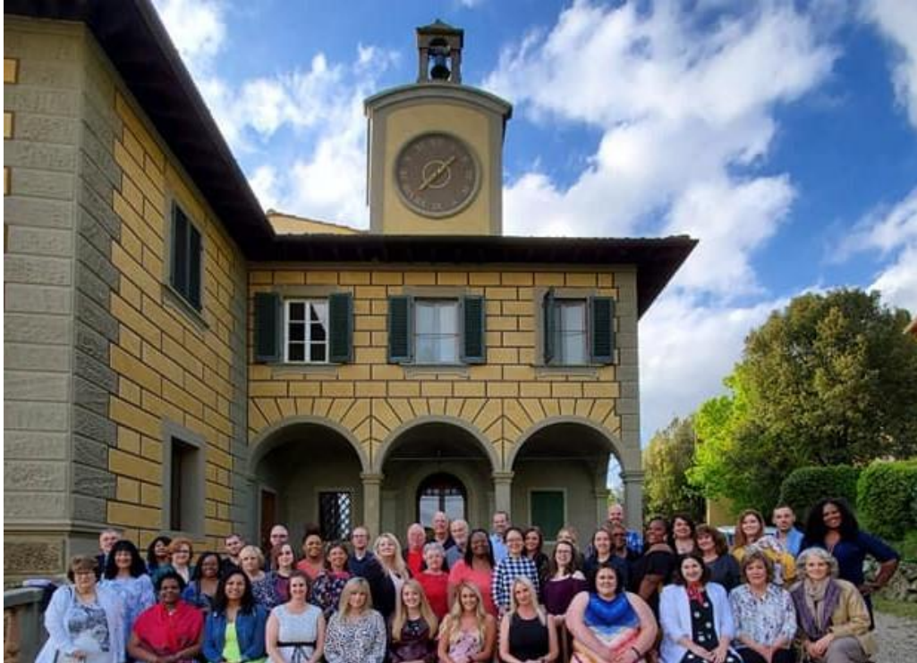
Participants in the 2019 Institute